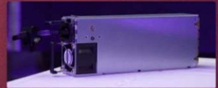
G1483-0600WNB , hot-swap 600 W power supply, available for purchase separately!

4K security cameras with built-in winter heating elements, LED ad screens, PoE-powered light fixtures – CRS320 can output up to 90W per port , enough even for the most demanding devices! It comes with a reliable 600 W power supply, but we've reserved an expansion slot for an additional PSU, in case you need to raise the power output to 1150 W.