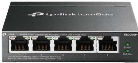
4 × Gigabit RJ45 ports with PoE+ 1 × Gigabit RJ45 port