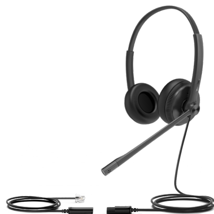
YHS34/YHS34 Lite Dual