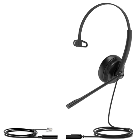
YHS34/YHS34 Lite Mono

Built for comfort with soft ear cushions and ultra-lightweight materials, the YHS34/YHS34 Lite is 10%~30% lighter than other headsets in the same range. Its ergonomic design makes this headset comfortable enough for long conference calls and all day use.